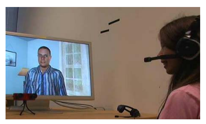
Fig. 1. A child telling a story to the RAPPORT AGENT

The RAPPORT AGENT (Figure 1) was designed to establish a sense of rapport with a human participant in "face-to-face monologs" where a human participant tells a story to a silent but attentive listener (Gratch et al., 2006). In such settings, human listeners can indicate rapport through a variety of nonverbal signals (e.g., nodding, postural mirroring, etc.) The RAPPORT AGENT attempts to replicate