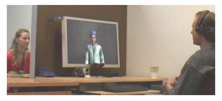
Fig. 3. Experimental setup

The Listener (left) sees a video image of the Speaker (right). The Speaker sees an Avatar allegedly displaying the Listener's movements. Stereo cameras are installed in front of both participants (Listener data is ignored but stored for data collection/analysis).